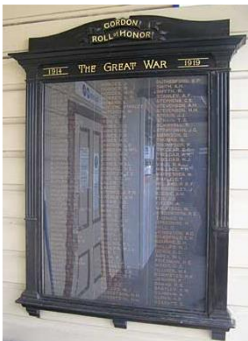
Gordon Roll of Honour