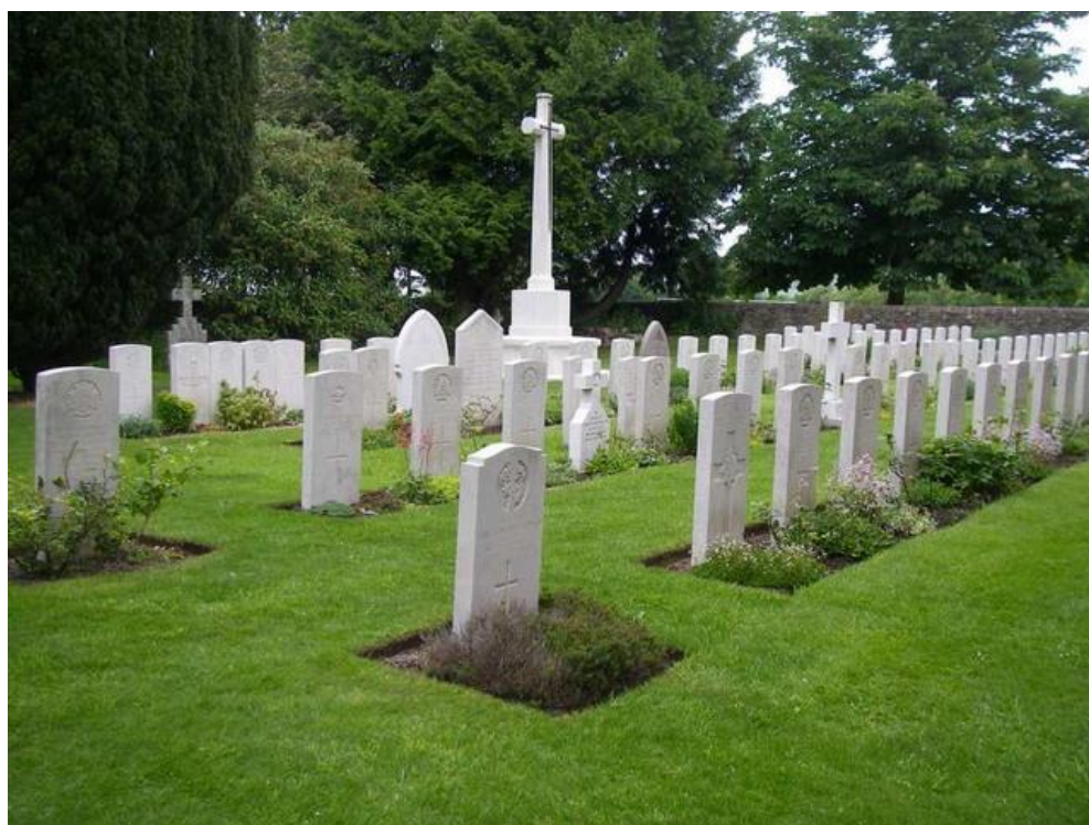
War Graves at Sutton Veny