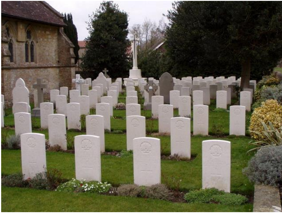
War Graves at Sutton Veny